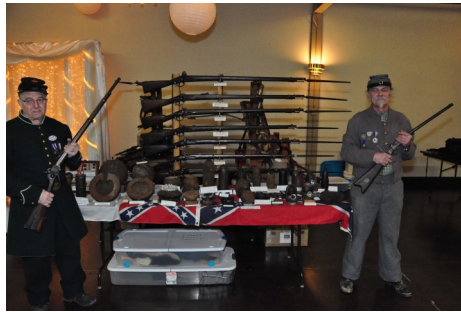
Sons of the Confederate Veterans (SCV) members attending.

“The distinctions between Virginians, Pennsylvanians, New Yorkers, and New Englanders are no more. I Am Not A Virginian, But An American!”—Patrick Henry in 1774 after the Boston Tea Party.