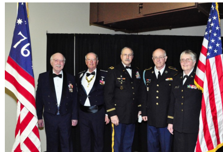
Retired military members in uniform attending the dinner.