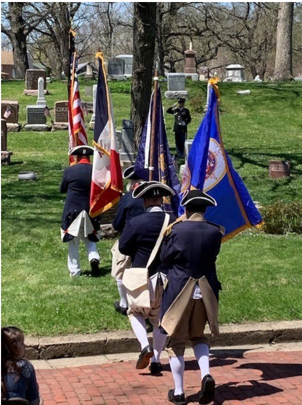
Color Guard marching in to post the colors