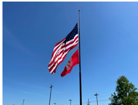
The flag seen from Hwy 31 outside of Gretna Auto Outlet