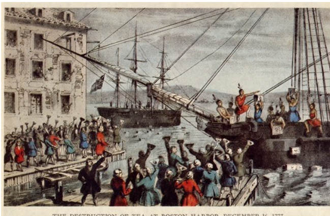
THE DESTRUCTION OF TEA AT BOSTON HARBOR, DECEMBER 16, 1773

It is in dispute whether Samuel Adams actually had any part in planning the Boston Tea Party, but after it occurred, he went right to work to publicize and defend it. He argued that the Tea Party was not the act of a lawless mob, but was instead a principled protest, and the only remaining option the people had in defending their constitutional rights. Britain responded by closing the port of Boston, and issuing the Intolerable Acts, which in turn caused for the calling of the First Continental Congress in 1774, to try to reconcile with the British Crown.