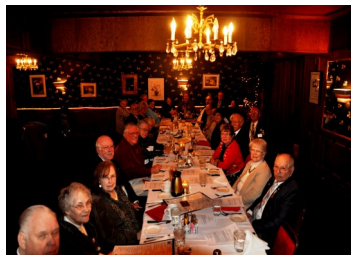
Omaha Chapter meeting conducted at the Venice Inn 14 January 2014.