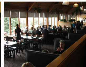
Lunch at Mahoney State Park during Nebraska SAR Spring Meeting.