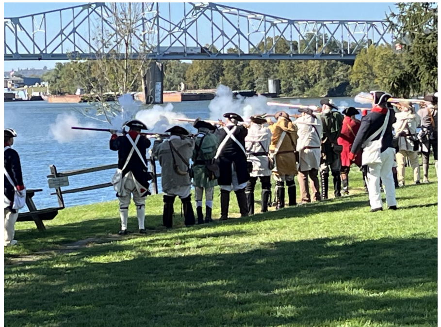
Musket Salute by the SAR Musketsmen