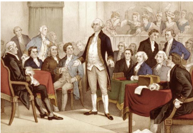
Delegates to the First Continental Congress

The First Continental Congress is sometimes forgotten over the Second Congress and all that happened when the delegates reconvened. The shooting war had begun, an army was starting to be formed, and talk of declaring independence was gaining ground and finally came to fruition with the Declaration in 1776. The First Continental Congress was the first step in bringing all the colonies together for a common purpose and setting the stage for the formation of the United States.