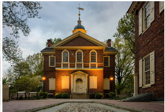
Carpenter's Hall Philadelphia, PA