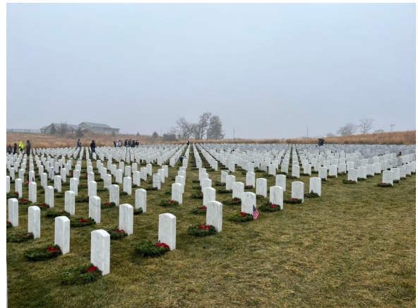
Top—Color Guard at Prospect Hill Cemetery Above—Fort McPherson National Cemetery Right—Omaha National Cemetery