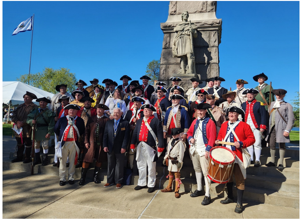
National SAR Color Guard Mustered for the 250th Anniversary of the Battle of Point Pleasant