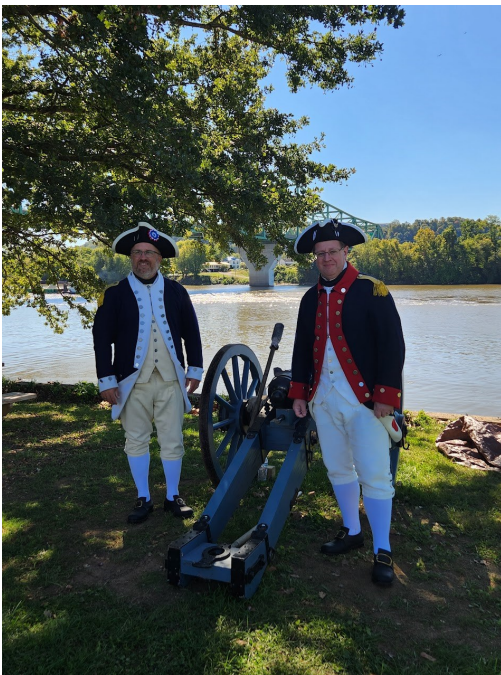
This cannon overlooks the Ohio River and was fired during the musket salute